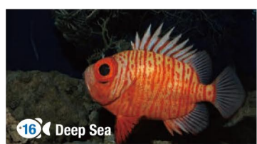
16 Deep Sea