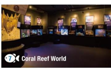
7 Coral Reef World

6 The Sea of Tropical Fish The exhibit offers various angles for visitors to observe the colorful fishes. This exhibit contains the most species of marine life in the aquarium.