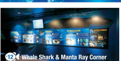
12 Whale Shark & Manta Ray Corner

This learning space has a special shark tank. You can study the jaws of different shark species, and watch video clips of our shark research.