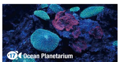
17 Ocean Planetarium

The Deep Sea lets you observe creatures that ordinarily live at depths of 200 meters or more. Leisurely watch beautiful fish emerge from the darkness.