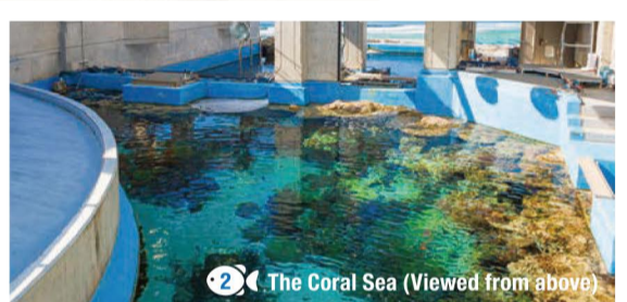
2 The Coral Sea (Viewed from above)

Enjoy the view from above the "Coral Sea" as it sparkles in natural sunlight.