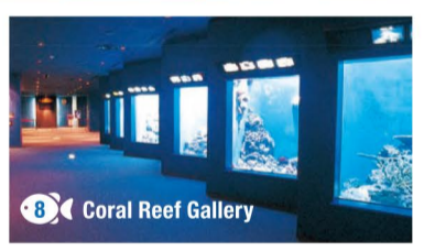
8 Coral Reef Gallery